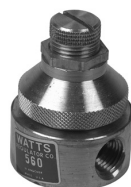
PRESSURE REDUCING VALVE (PRV) 006741

The hydraulic concentrate control valve can be used in conjunction with any type of closed-head sprinkler system (wet pipe, dry pipe, and pre-action). It can also be used in open-type deluge systems. To pressurize the valve, the water line is commonly run from the alarm trim of the sprinkler valve (see "Typical Piping Arrangement"). The pressure sensing line to the actuator should be a minimum of 1/4 in. pipe or alternate 3/8 in. tubing (the actual connection to the actuator is 1/8 in. NPT). The actuators are sized to operate with a minimum pressure of 30 psi (2.1 bar). Technical Services should be consulted for applications where the water pressure potentially could be lower. The maximum recommended water pressure to the actuator is 160 psi (11 bar). For higher pressures, a 1/4 in. FM Approved Pressure Reducing Valve 1 (PRV) (Part No. 415020) should be installed in the line to the actuator.