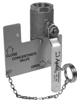
CONCENTRATE ISOLATION BALL VALVE 1 006738