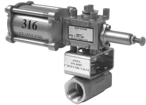
HYDRAULIC CONCENTRATE CONTROL VALVE 006740