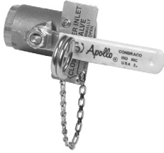
WATER INLET BALL VALVE 1 006739

ANSUL ball valves and swing check valves are available for use with most bladder tank foam systems. All valves are of bronze construction and have NPT connections. The water inlet and concentrate isolation ball valves feature nameplates with their respective name, ring pin, and tamper seal for visually monitoring that the position of the valves are correct.