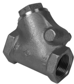
SWING CHECK VALVE 006742