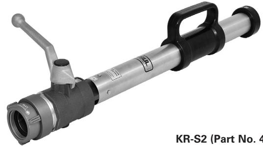
KR-S2 (Part No. 415981) 001227b

Two sizes are available for nominal flow rates of 60 gpm and 120 gpm at 100 psi (227 Lpm and 454 Lpm at 6.9 bar). Foam solution is sprayed through the nozzle and as air is drawn into the nozzle, foam is produced in the tube. Each nozzle has a ball shut-off valve. The nozzle tube is constructed of stainless steel with a tough polyurethane handle providing optimum protection against corrosion. Although the normal operating pressure is 75 psi to 100 psi (5.2 bar to 6.9 bar), a minimum operating pressure of 45 psi (3.1 bar) is acceptable. Foam concentrate is usually proportioned to the nozzle using the matching ANSUL Model Z eductor.