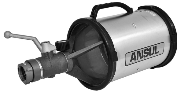
KR-M4 (Part No. 415984) 001228a

Two sizes are available for nominal flow rates of 60 gpm and 120 gpm at 100 psi (227 Lpm and 454 Lpm at 6.9 bar). Foam solution is sprayed through the nozzle and as air is drawn into the nozzle, foam is produced in the tube. Each nozzle has a ball shut-off valve. The nozzle tube is constructed of stainless steel with a tough polyurethane handle providing optimum protection against corrosion. Although the normal operating pressure is 75 psi to 100 psi (5.2 bar to 6.9 bar), a minimum operating pressure of 45 psi (3.1 bar) is acceptable. Foam concentrate is usually proportioned to the nozzle using the matching ANSUL Model Z eductor.