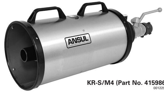
KR-S/M4 (Part No. 415986) 001229a

Two sizes are available for nominal flow rates of 60 gpm and 120 gpm at 100 psi (227 Lpm and 454 Lpm at 6.9 bar). Foam solution is sprayed through the nozzle and as air is being drawn into the nozzle, foam is produced in the tube. Each nozzle has a ball shut-off valve. The nozzle tube is constructed of stainless steel with a tough polyurethane handle providing optimum protection against corrosion. Although the normal operating pressure is 75 psi to 100 psi (5.2 bar to 6.9 bar), a minimum operating pressure of 45 psi (3.1 bar) is acceptable. Foam concentrate is usually proportioned to the nozzle using the matching ANSUL Model Z eductor.